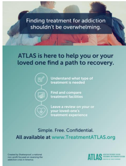
11" X 17" POSTER