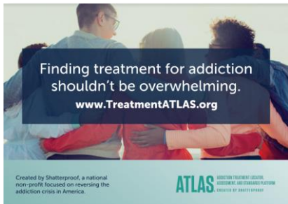
5" X 7" POSTCARD