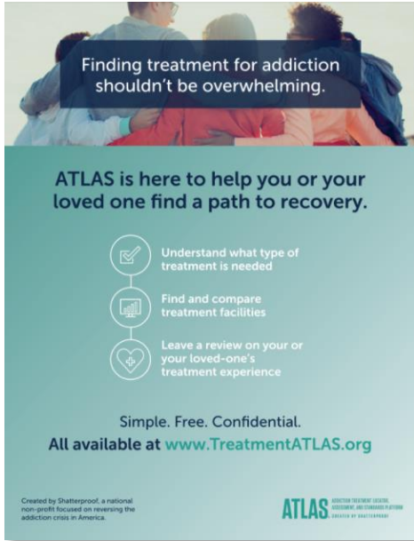
18" X 24" POSTER